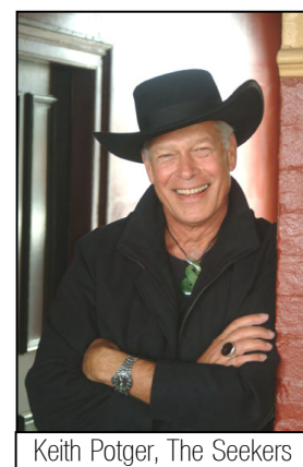
Keith Potger, The Seekers