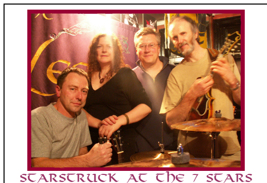
SCARSTRUCK AT THE 7 STARS